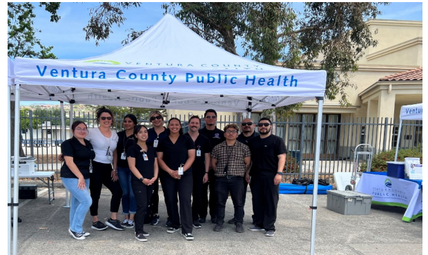
Immunization event at Isbell Middle School

Ventura County Public Health’s Immunization Program will be hosting free Tdap immunization events for students entering the 7th grade in the 2024-2025 school year. Tdap is a required vaccine needed to enter into the 7th grade. More information to come regarding Tdap events!