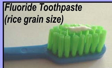
Fluoride Toothpaste (rice grain size)