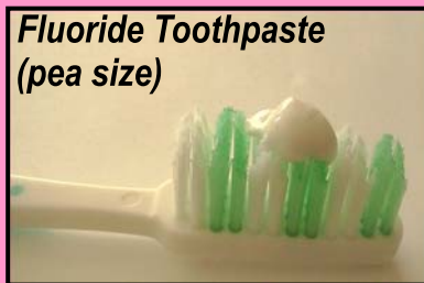
Fluoride Toothpaste (pea size)