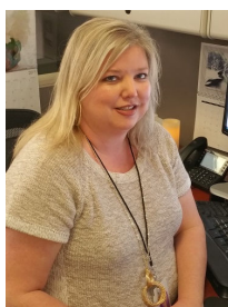
Gold Coast Health Plan

When a child is identified as having a special health care need, you may find it valuable to reach out to a GCHP Care Manager! GCHP Care Management Department provides coordination of care, complex and non-complex care management to eligible members with specific diagnoses or special health care needs. Gold Coast Care Managers coordinate with Tri-Counties Regional Center, California Children’s Services, Public Health and other community agencies and programs to enhance health outcomes for our pediatric members. We engage families, specialists, behavioral health, and community partners and serve as a bridge to better serve children and families.